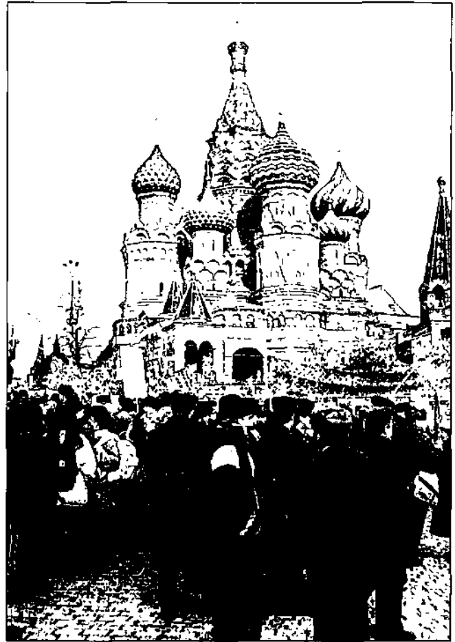
Protesting crowds gather in Kremlin Square.

Fortunately, no missiles were launched. But in an article six years later in an issue of the magazine Soviet Military Review , Soviet military leaders made a strong case for exchanging UFO information, on a regular basis, with the West. It was suggested if the